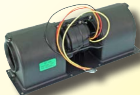
Dual Wheel Blower Trans Air TA412019