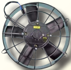
11" Condenser Fan