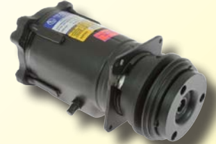
Compressor A6 1Gr 12v 10:00 Carrier 502-216