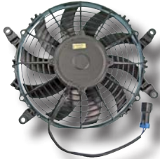
10" Condenser Fan