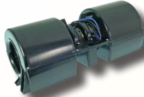
Dual Wheel Blower Carrier 401-209